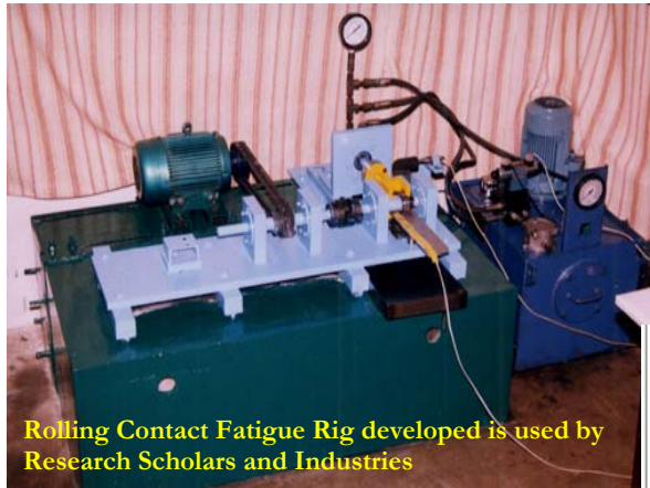
Rolling Contact Fatigue Rig developed is used by Research Scholars and Industries