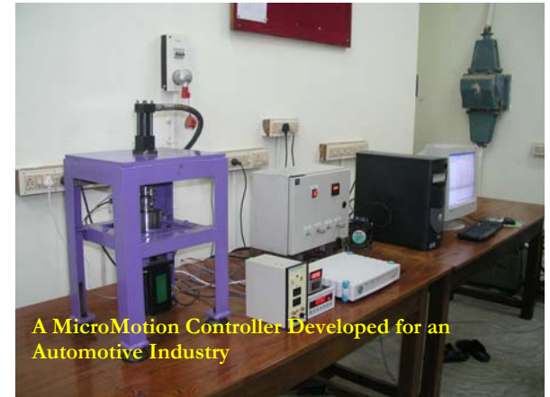
A MicroMotion Controller Developed for an Automotive Industry