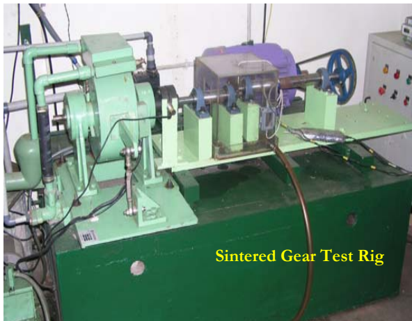
Sintered Gear Test Rig