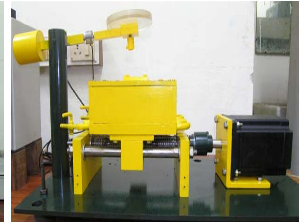
Computer Controlled Programmable Reciprocating Tribo Test Facility