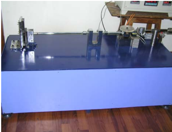
Fretting Wear Simulator for Micro Motions