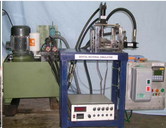
Programmable Dental Simulator