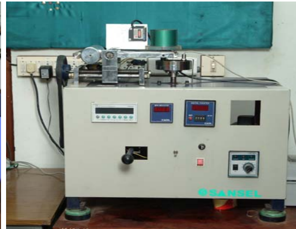
High Temperature Test Single Pass Test Facility