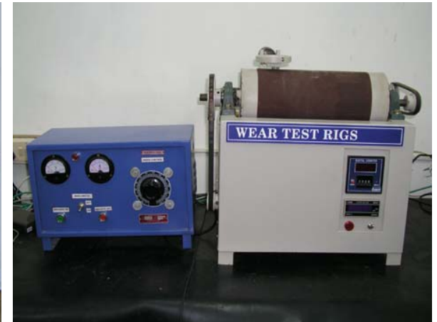
A Novel Abrasion Test Unit with sophisticated Instrumentation for On-line Condition Monitoring